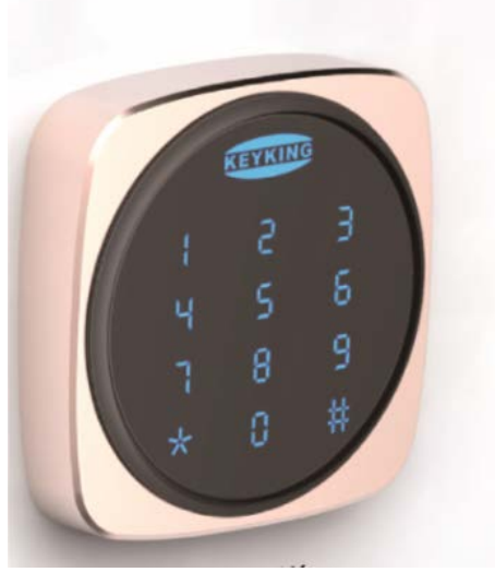
RY01KP ( Proximity Reader)